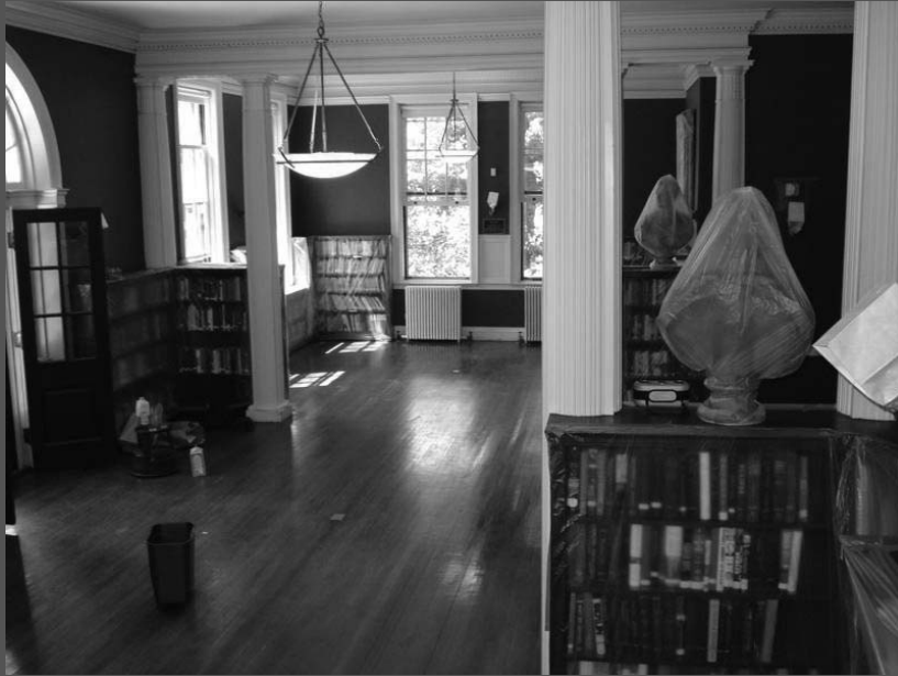
Before: Empty Reading Room