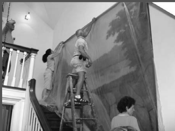
Protecting the Mural