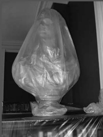
Protecting Lord Byron