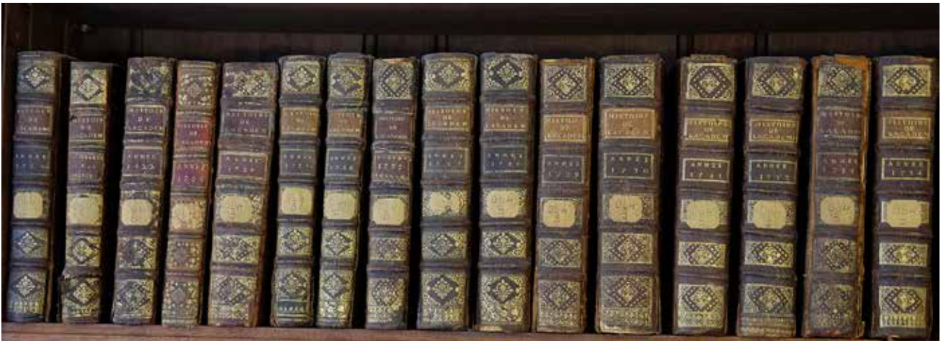
Historie de l'Academie Royale des Sciences, 1702–1781.

Once owned by British chemist Richard Kirwan, this periodical was aboard a ship captured by a Beverly privateer in 1780. Kirwan's library became the nucleus of the Salem Philosophical Library, which in turn became part of the Athenæum upon its founding in 1810. In 1791, two Salem ministers let an 18-year-old apprentice named Nathaniel Bowditch use the Kirwan collection. It was from these books that Bowditch taught himself the mathematics that enabled him to change marine navigation forever.