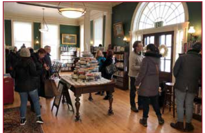
Over 1,000 guests explored the library during Christmas in Salem's Holiday House Tour, December 7-8.