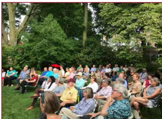
A packed garden marks the kick-off of Summer Salon season on July 12.