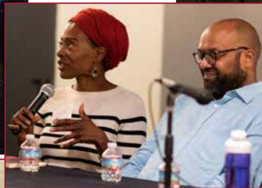
10th Salem Literary Festival highlights