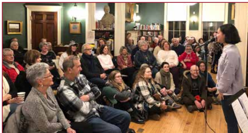
Riveted listeners at the "Bad Romance" live storytelling event, February 15, 2020.