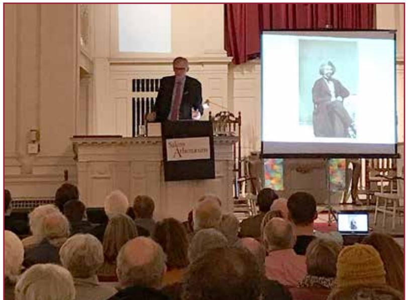
Pulitzer Prize-winning author David Blight presents the 2019 Adams Lecture, Frederick Douglass: Prophet of Freedom , at Tabernacle Church on November 18.