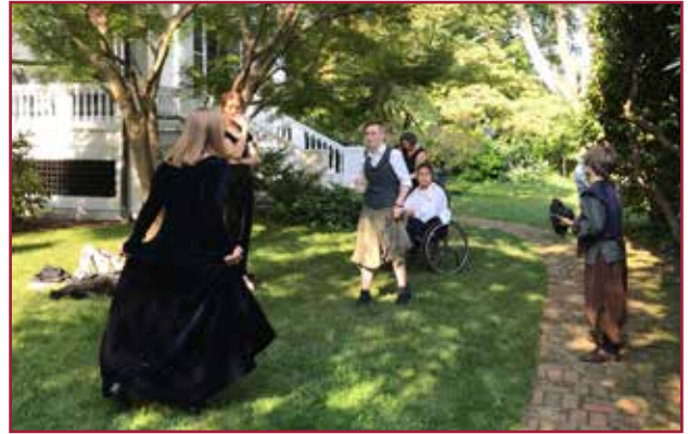
"Back stage" at Rebel Shakespeare's performance of Twelfth Night in the Athenæum garden, July 28, 2019.