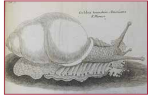
Snail illustration from Martin Lister's A Journey to Paris in the year 1698 .

Letters on natural magic addressed to Sir Walter Scott. New York, 1832.