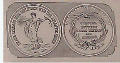
Medal Commemorative of the Treaty of Peace