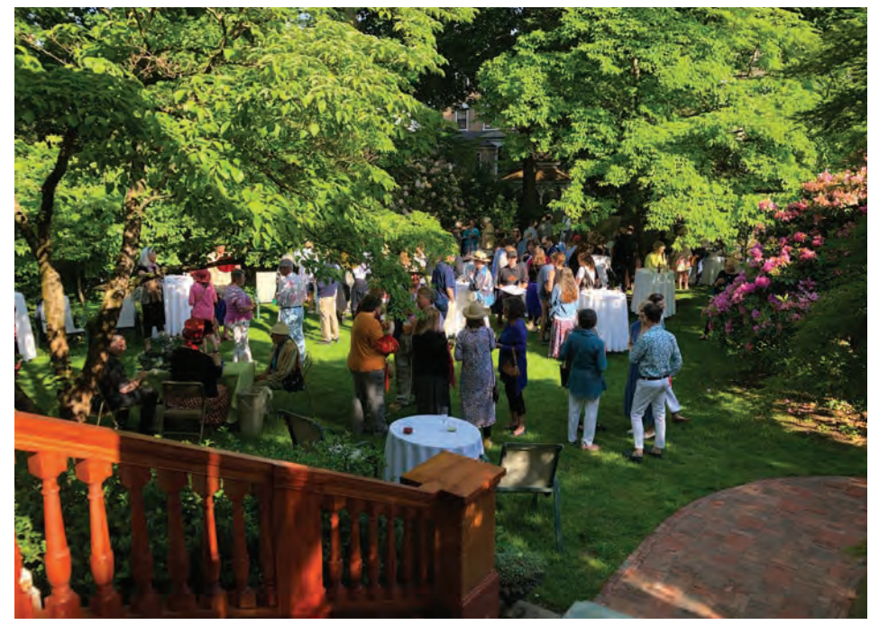
Athenaeum Garden View from the newly restored back steps, June 4, 2022.

Cinema Salem Copper Dog Books The J. Paul New England Dog Biscuit Salem Five