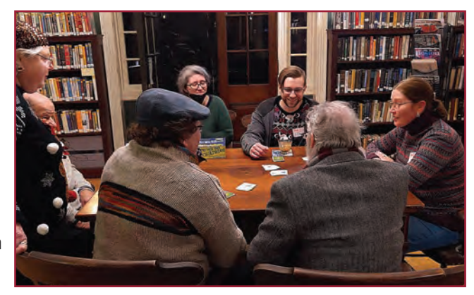
Members and friends gathered on the Winter Solstice, December 21, for an evening of fellowship and poetry.