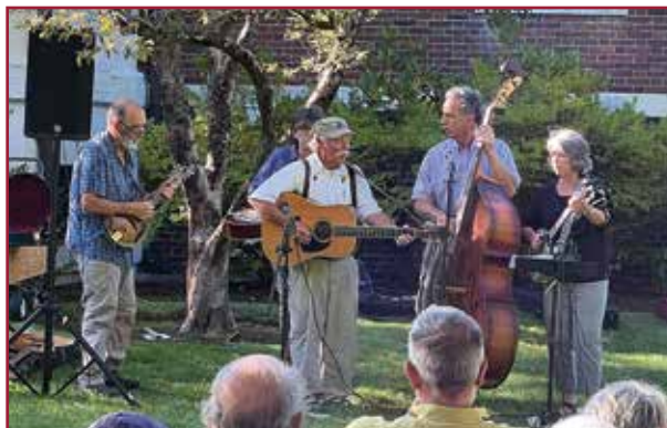
The Crabgrass Band took over the garden, August 11.