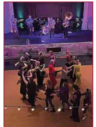
Second Line at Tardi Mardi Gras, March 23.