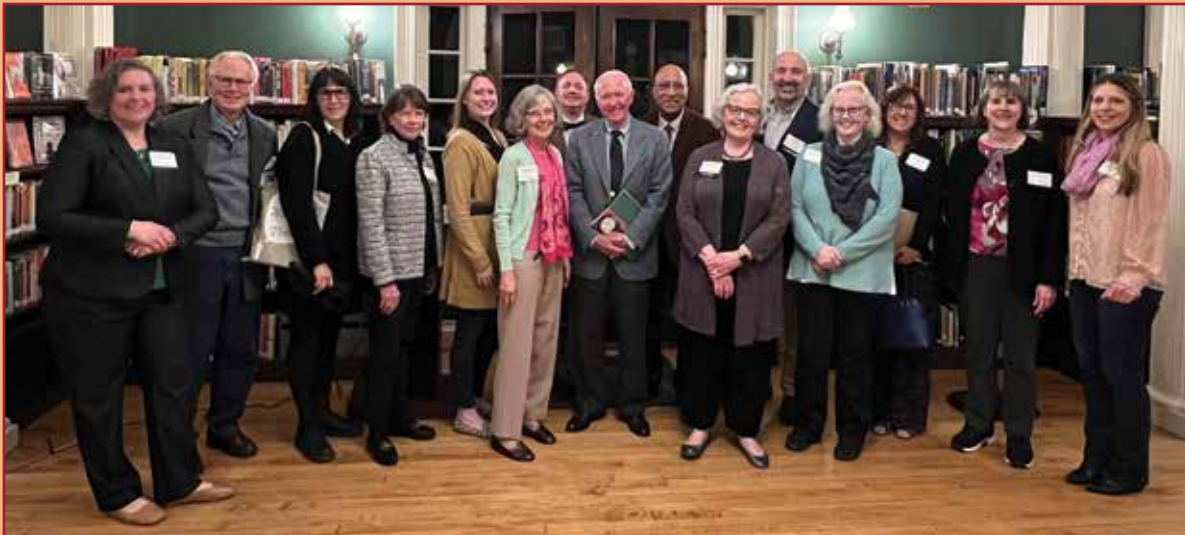
Incoming and outgoing trustees at the 213th Annual Meeting on May 4, 2023.