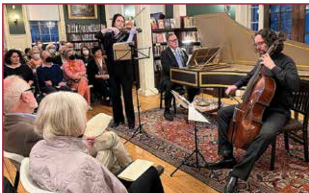
Boston Classical Trio mesmerizes its audience, April 15, 2023.

Salem Film Fest Screening: "Story & Pictures By," March 24