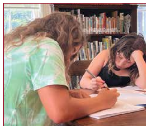
Summer Simmer students, July 24-28.