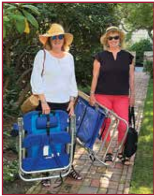
Summer Salon guests with chairs at the ready!