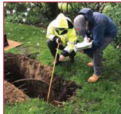
Engineers determining water table level on the property, May 2023.

A new heat pump HVAC unit installed in April 2023 in the Rare Book Room helps to maintain a stable environment in a space where it is most important for our collections. However, water continues to challenge us on the exterior of the building. After soil testing and a drainage study, we plan to implement in stages a system that will link all downspouts to drains, sending water away from the building perimeter to an absorption pit at the back of the property. To address rainwater cascading over the gutters embedded in the building cornice, additional downspouts will be added in the coming year.