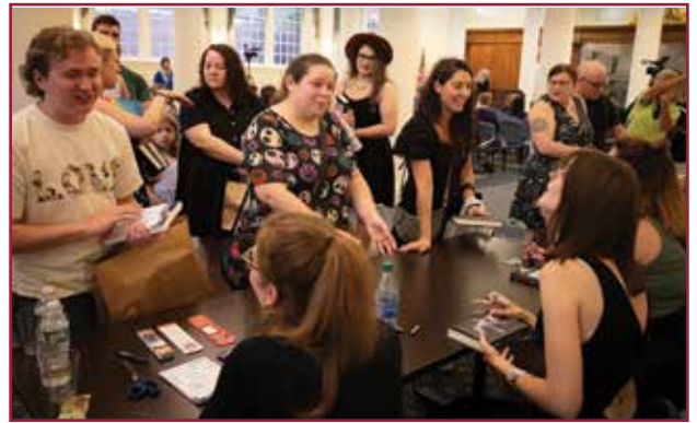
Readers meet their favorite authors at the Young Adult book sessions during Salem Lit Fest, September 9, 2023.