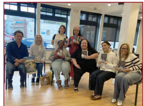
Club de Lectura at Espacio on August 19