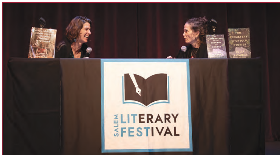
Keja Valens in conversation with Julia Alvarez, September 7