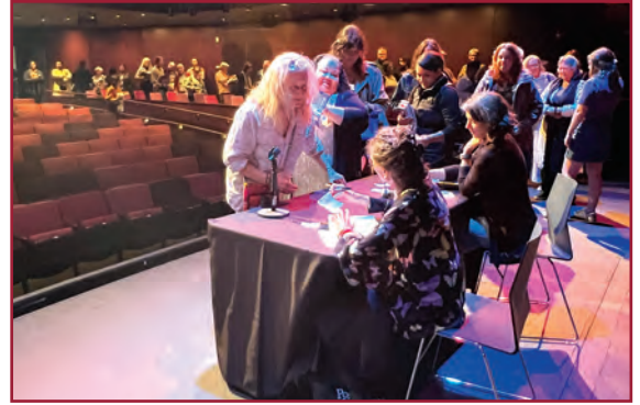
Julia Alvarez spoke in depth to each audience member who approached her and charmed us all.