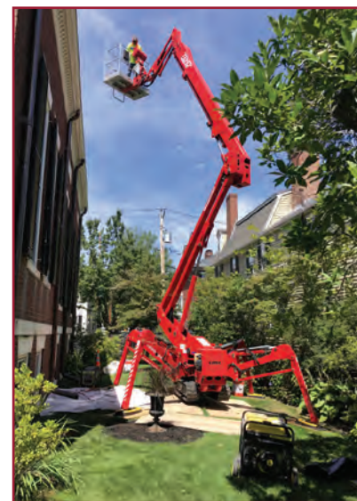
Murray Masonry & More preparing to repoint the east chimney.

This past year, due to a generous contribution from a trustee, we were able to accomplish numerous tasks on our maintenance wish list this year. We had the east chimney repointed, finalized the drainage plan by Hancock CE, replaced aging bricks in the garden walk, parged over crumbling bricks in the basement, and gave our enormous linden tree a serious pruning. Also now sparkling clean are the windows, as well as our front steps, after a much-needed power washing. The joints on the front steps were also repointed. You may (or may not) have noticed a change in our first floor restroom—the lovely marble counter had to be removed, due to leaking in the enamel bowl affixed to its underside. The counter is safely stored in the basement—we may be able to reuse it in our redesigned ADA version of this restroom, as part of our accessibility project.