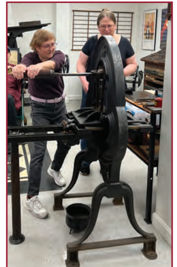
Operating an antique printing press at Museum of Printing, May 3, 2025